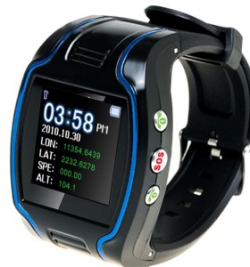
DEMWatch Biometric Monitoring and Tracking watch